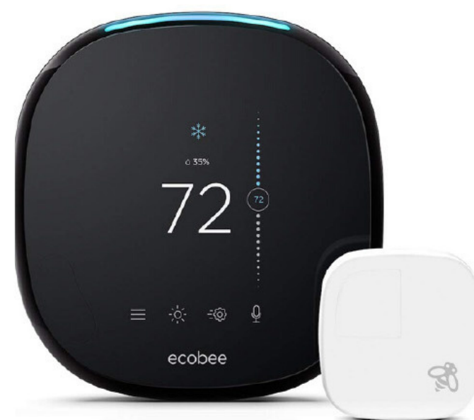
ECOBEE4 SMART THERMOSTAT WITH BUILT-IN ALEXA