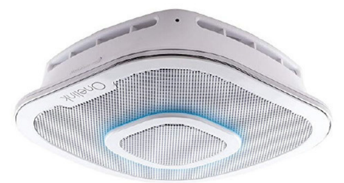
(4) ONELINK SMOKE & CARBON MONOXIDE DETECTORS