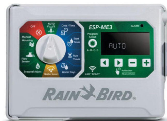
RAIN BIRD WIFI- ENABLED IRRIGATION CONTROLLER