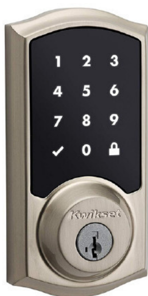
KWIKSET Z-WAVE SMARTCODE TOUCHSCREEN ELECTRONIC DEADBOLT