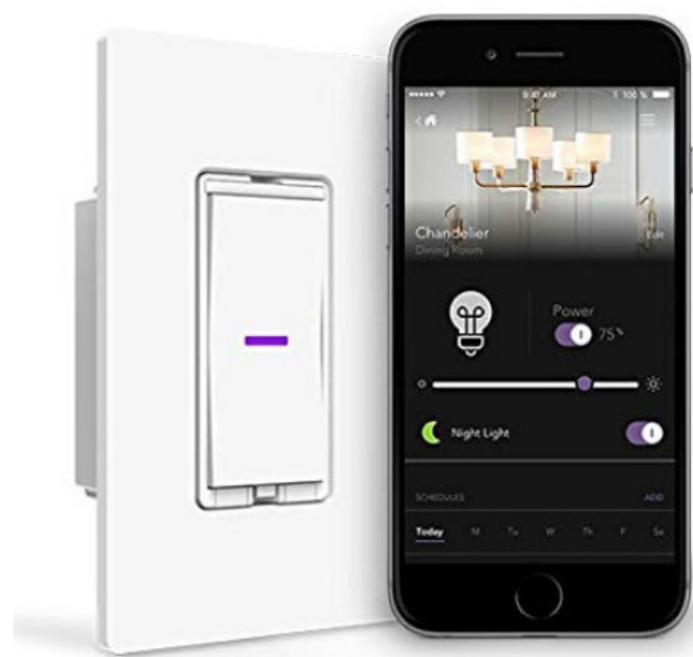
(5) IDEVICES IDEV0009 WI-FI SMART SWITCHS