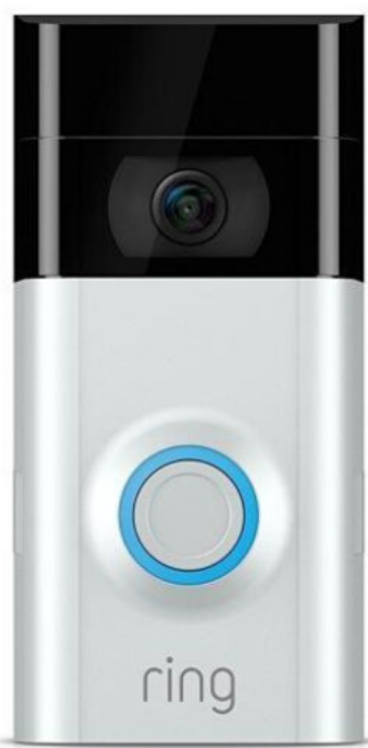
RING VIDEO DOORBELL PRO, WITH MOTION ACTIVATED ALERTS