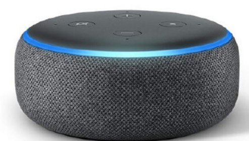
ECHO DOT (3RD GEN) SMART SPEAKER WITH ALEXA