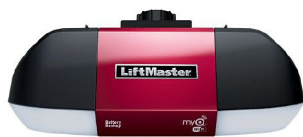
LIFTMASTER MYQ GARAGE SMARTPHONE GARAGE DOOR