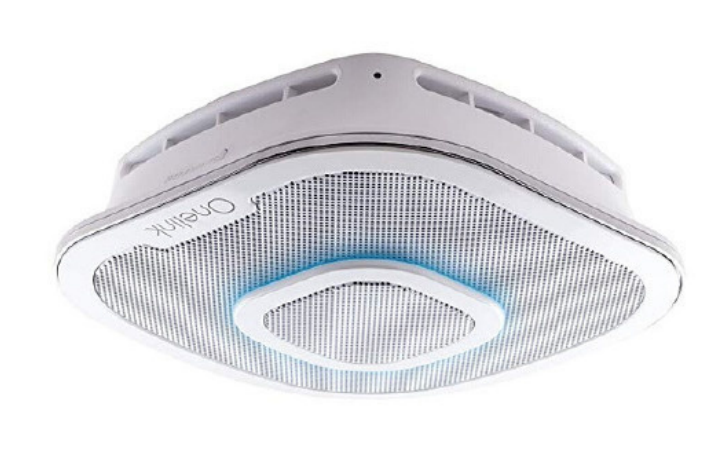
(4) ONELINK SMOKE & CARBON MONOXIDE DETECTORS