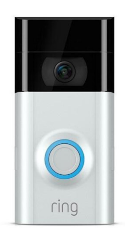
RING VIDEO DOORBELL PRO, WITH MOTION ACTIVATED ALERTS

STANDARD CONNECTED SMART HOME AUTOMATION SUITE