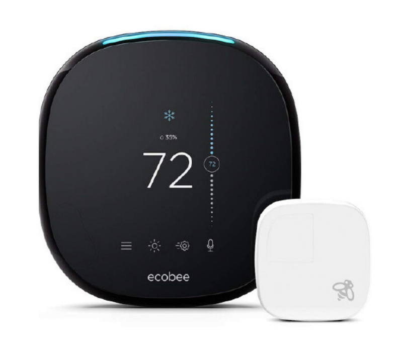
ECOBEE4 SMART THERMOSTAT WITH BUILT-IN ALEXA