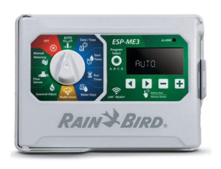
RAIN BIRD WIFI-ENABLED IRRIGATION CONTROLLER