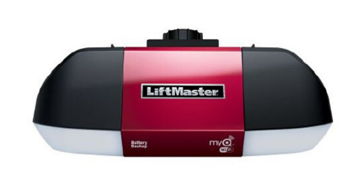
LIFTMASTER MYQ GARAGE SMARTPHONE GARAGE DOOR