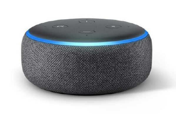
ECHO DOT (3RD GEN) SMART SPEAKER WITH ALEXA