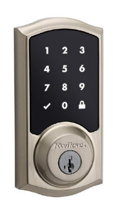
KWIKSET Z-WAVE SMARTCODE TOUCHSCREEN ELECTRONIC DEADBOLT