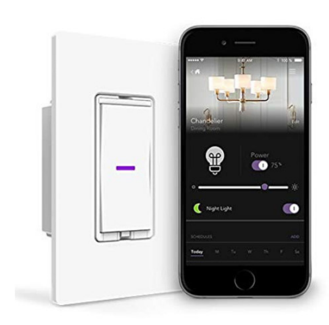
(5) IDEVICES IDEVOOO9 WI-FI SMART SWITCHS